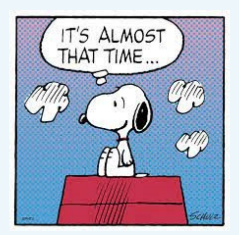
ANNUAL REPORTS DUE IN OFFICE NO LATER THAN TUESDAY, JAN 2<sup>ND</sup>

We need to be able to have our Annual Report Booklet available to the congregation on the Sunday before the meeting (January 21st). As it takes time to assemble all the documents needed for this report, we really need all our committees and teams to get your reports turned in! You may either drop them off to the church office, or email to uc@gwtc.net.